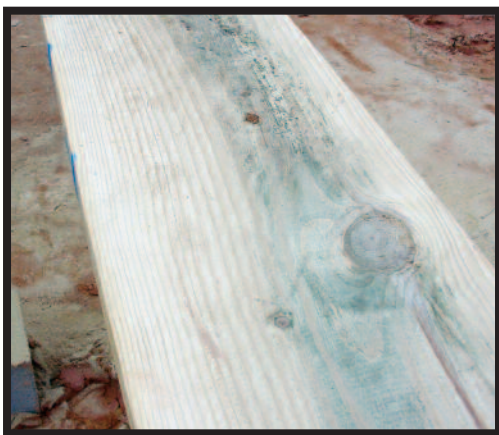
Blue-stained Southern Pine lumber