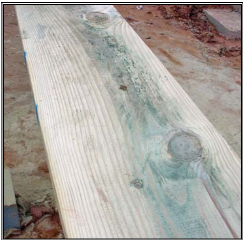
Blue-Stained Southern Pine Lumber.