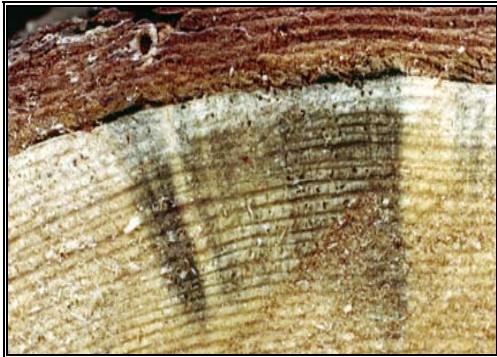
Blue Stain Fungus Penetration in Southern Pine log cross-section.